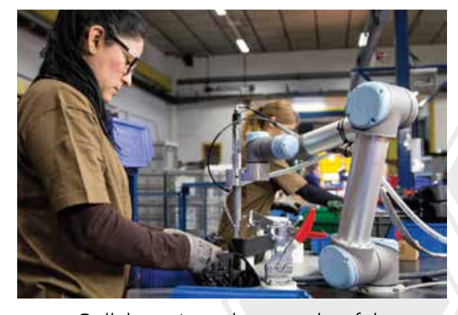
Collaborative robots work safely next to people.

HTE will conduct a free work cell acceleration review in your plant. Our focus is on maximizing your goals for productivity, flexibility, quality control, and safety.